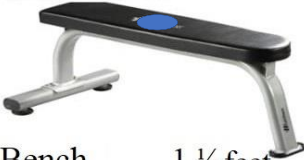
Flat Bench 1 ½ feet