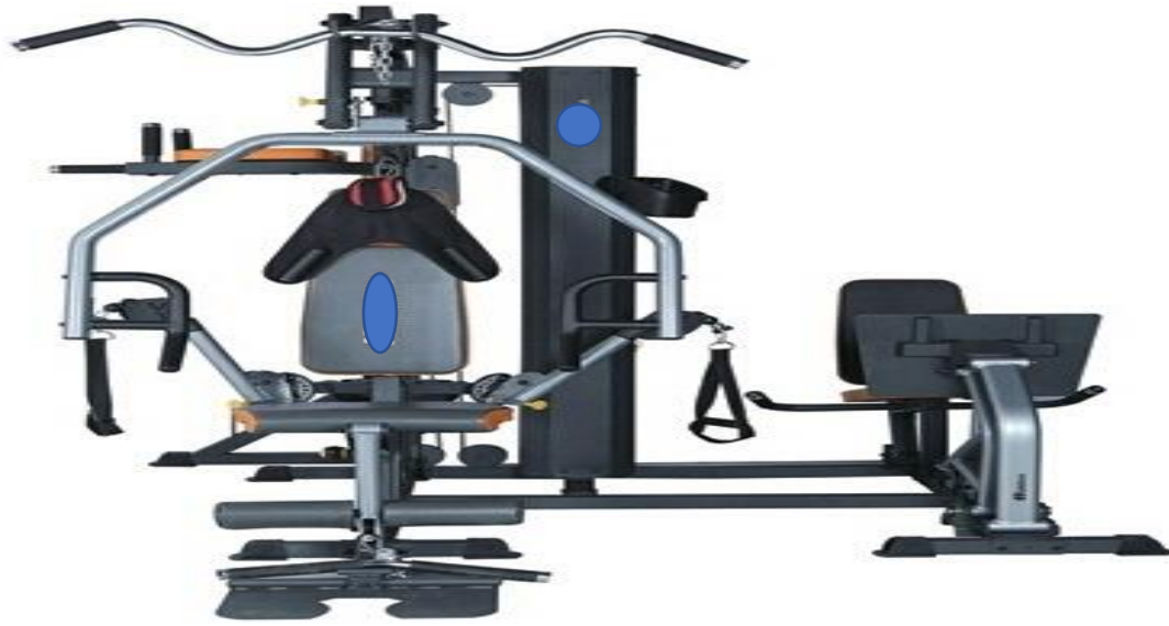
Ser No 6. Multi Gym