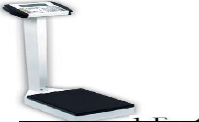
Ser No 21. Weighing Machine