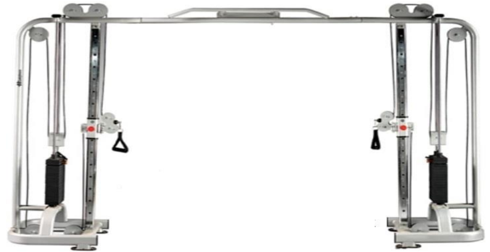
Ser No 5. Cable Cross Over