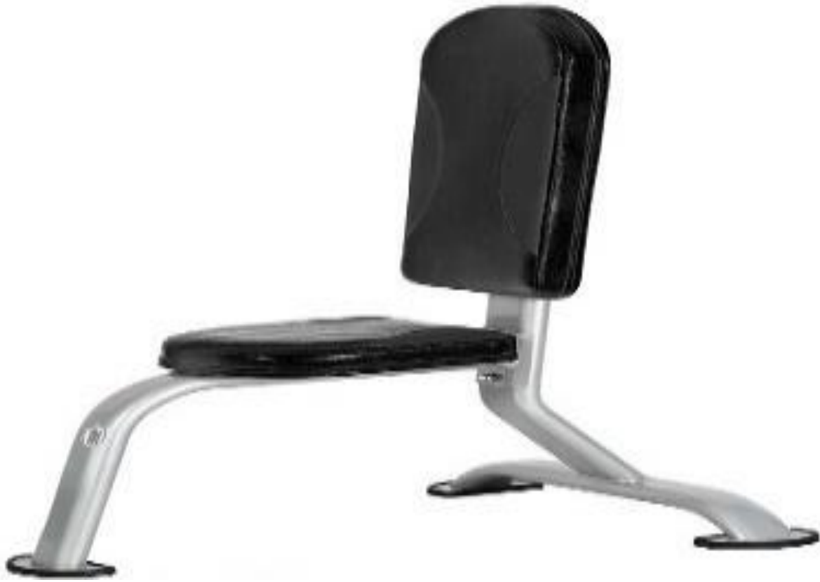
Ser No 13. Stool