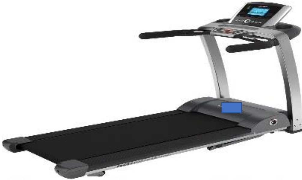
Ser No 3. Treadmill