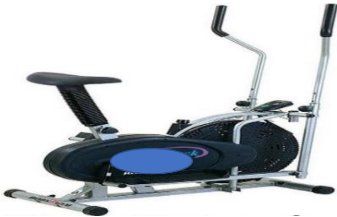
Ser No 4. Elliptical Trainer