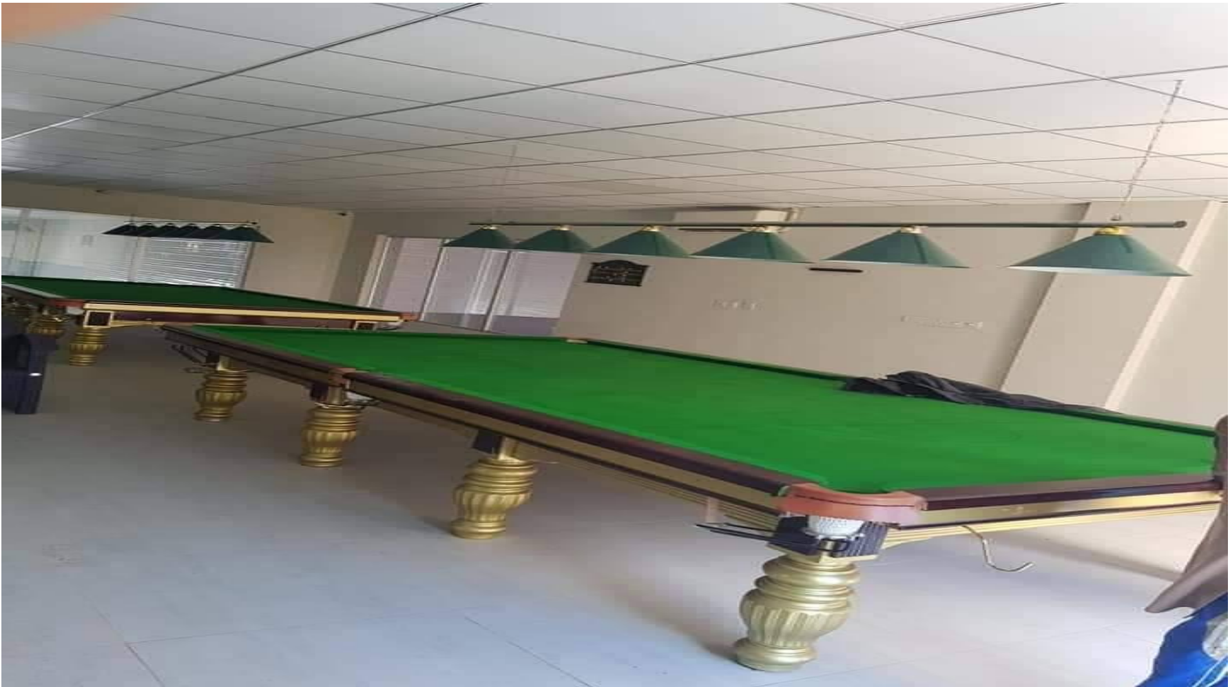
Ser No 2 - Snooker Table (Local)