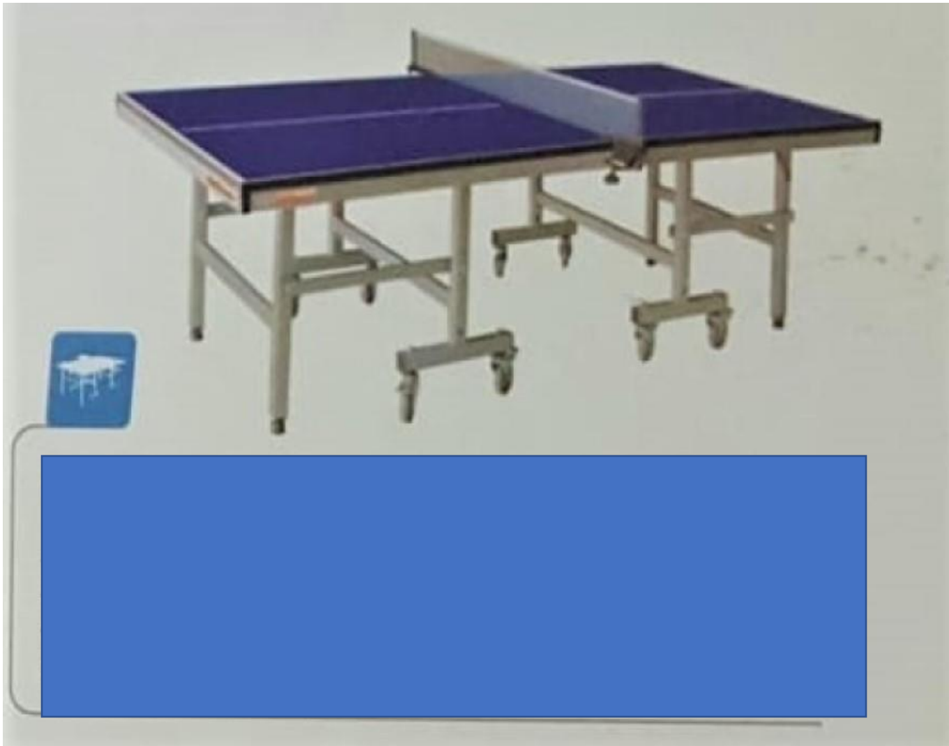
Ser No 1. Table Tennis (China)