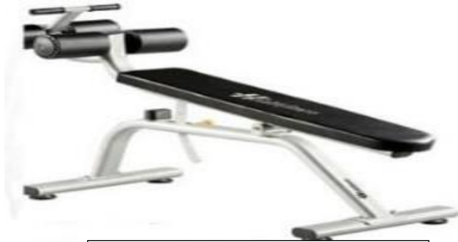
Ser No 15. Adjustable Sit up bench