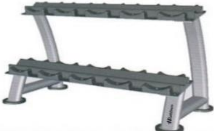
Ser No 9. Dumbbell Rack