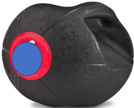
Ser No 19. Medicine Ball 4Kg