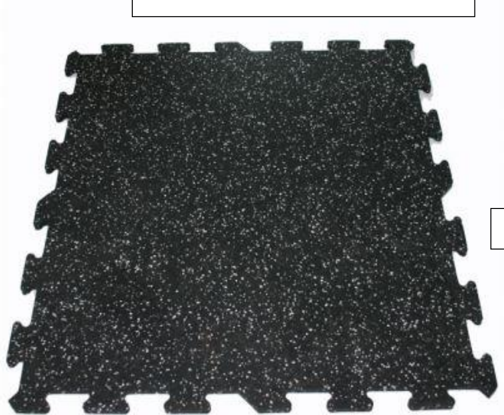
Ser No 16. Exercise mat