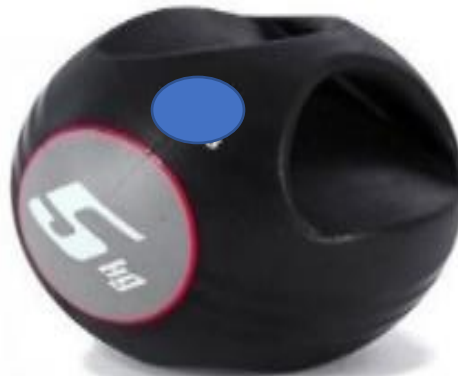
Ser No 20. Medicine Ball 5Kg