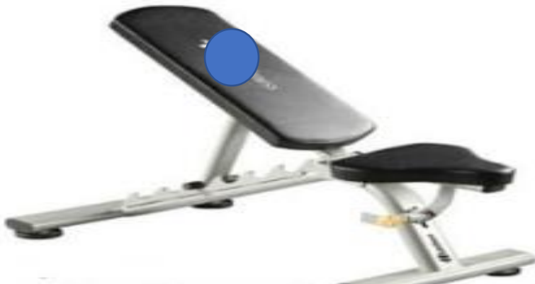
Ser No 14. Adjustable Bench